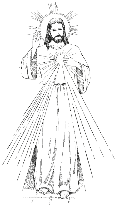
JESUS, I TRUST IN YOU