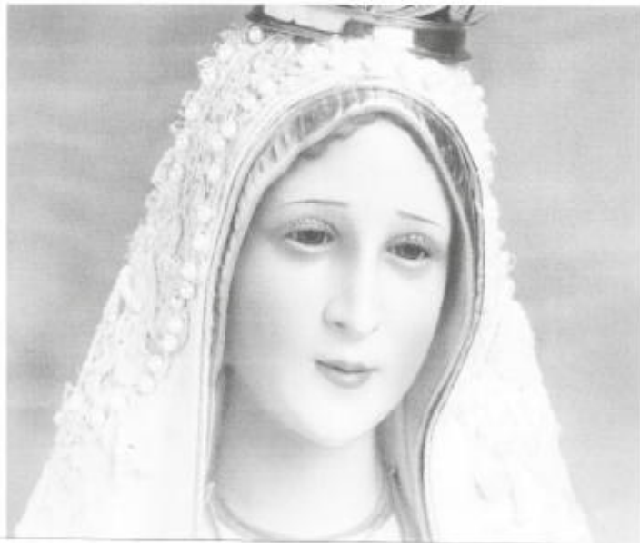
SAINT JOACHIM CHURCH MARIAN FESTIVAL -FESTIVAL MARIANO

We invite you to this special celebration to pray together in honor of Our Mother Mary. Los invitamos en esta celebracion especial para orar juntos en honor a Nuestro Madre Maria.