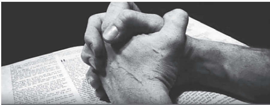
Talleres de Formación Espiritual