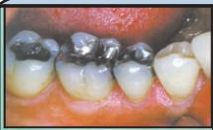
Before Creative Smile

Auto | Home | Life | Business | Renters 510-878-7555 ngarcia1@farmersagent.com www.farmersagent.com/ngarcia1