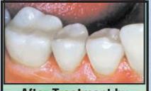
After Treatment by Creative Smile

BE SURE YOUR DENTIST USES FDA-APPROVED DIGITAL X-RAYS TO REDUCE EXPOSURE TO HARMFUL X-RAYS TO YOUR FAMILY & YOU UP TO 90%